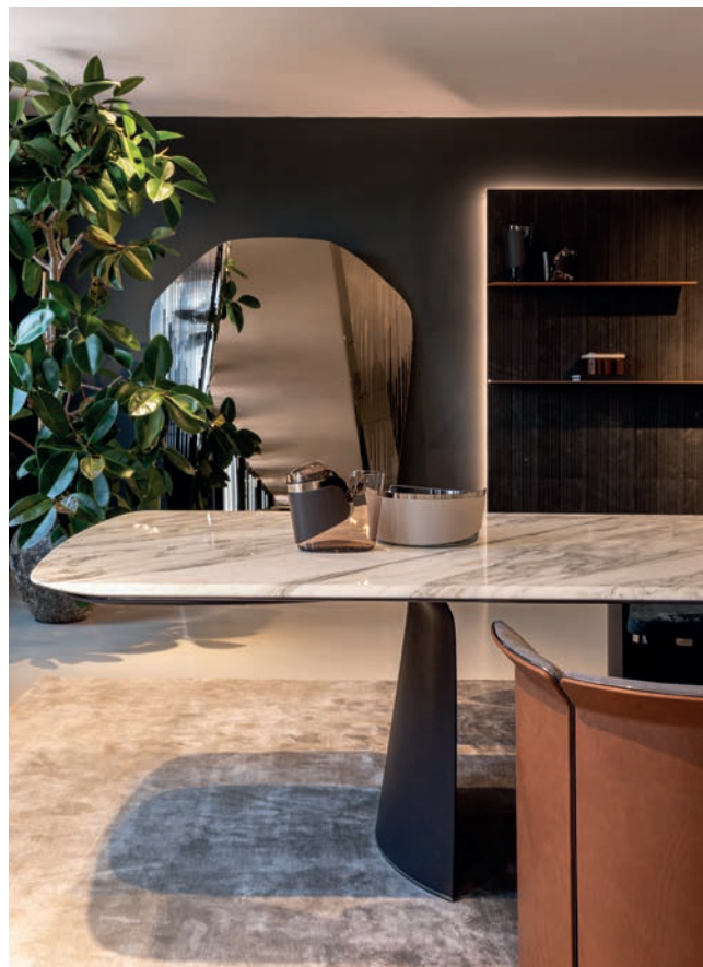
Above: the Aldford Table, finished in marble. In the background, the Stirling Mirror, which is made from a single piece of glass and is inspired by the signature curvature of the collection

Precious materials and strong lines define the luxury collection of furniture inspired by Bentley's unique design vision